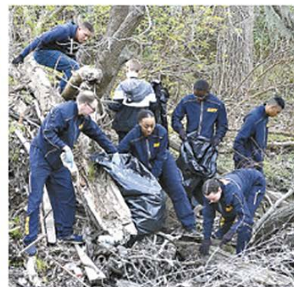
Basura Bash volunteers clean up Salado Creek Page 8