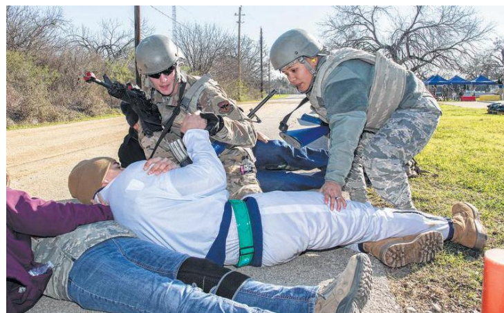
37th Training Wing personnel assist a civilian with a mock injury inflicted by opposing forces during the bivouac exercise Feb. 13 Joint Base San Antonio-Lackland Medina Annex.