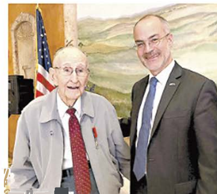
WW II veteran awarded French Legion of Honor Page 16