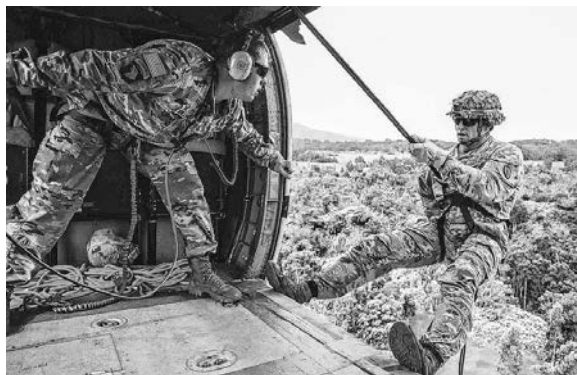
SGT. SARAH SANGSTER

For fiscal 2021, DOD is asking for $28.9 billion to fund modernization of the nuclear defense program, covering all three legs of the nuclear triad: land, sea and air.